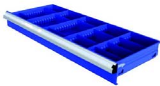
5UCD1 100mm drawer with dividers