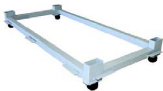
5 UCB Adjustable Base

*2 Year warranty covers materials & workmanship. Does not cover misuse or abuse.