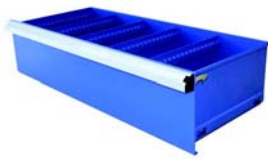
5UCD2 drawer with dividers